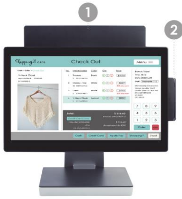
1 Second Display 2 MSR